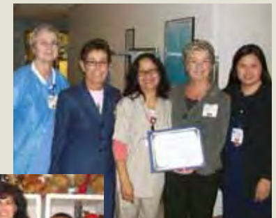
Doheny ICU Nurses