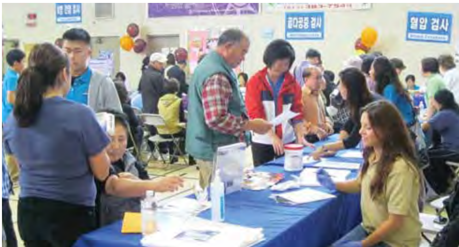
SVMC MHAP Center outreach team provides body fat screening at the Korean Community Health Fair