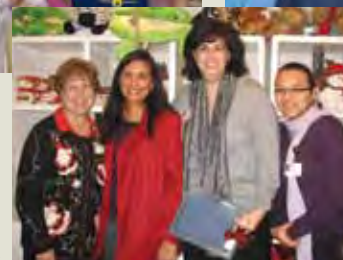
Patient Relations Team

You can make a secure online gift in honor of your own Guardian Angel at www.svmcfoundation.org .